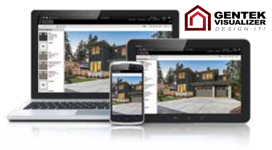
Elevate the look of your projects and sales presentations with the Gentek Visualizer design tool at gentekusa.renoworks.com.