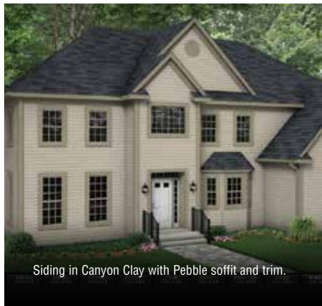
Siding in Canyon Clay with Pebble soffit and trim.