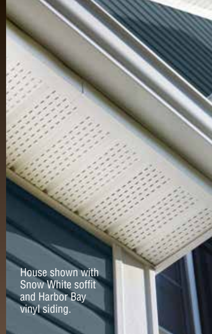
House shown with Snow White soffit and Harbor Bay vinyl siding.

Built weather-tough, Gentek soffit will protect the hard-to-reach areas of your home with a resilient finish that never needs to be painted. Choose solid and vented profiles to create the ideal soffit system for your home.