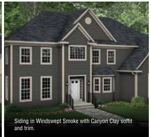
Siding in Windswept Smoke with Canyon Clay soffit and trim.