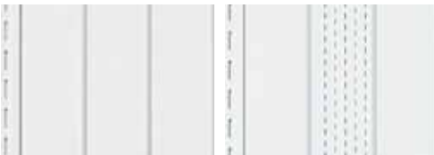
12" T-4 Solid Soffit/ Vertical Siding