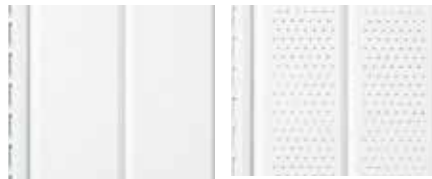
10" D-5 Solid Soffit/ Vertical Siding