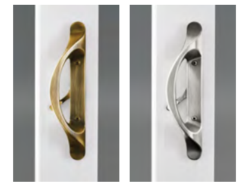
Antique Brass Brushed Chrome

The gracefully contoured French-style patio door handle includes a top lock for added resistance.