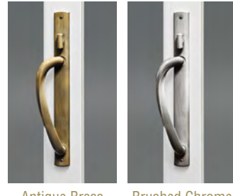
Antique Brass Brushed Chrome