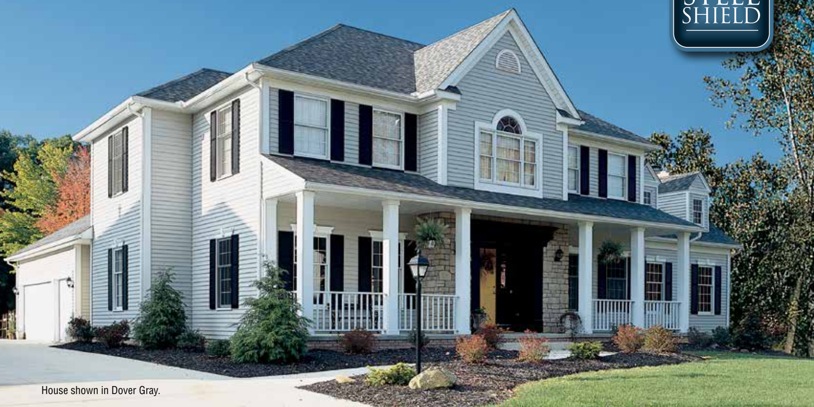
House shown in Dover Gray.