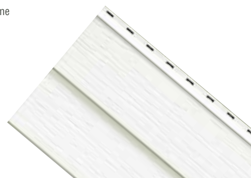
Double 4" Clapboard

Accent the architecture of your home with coordinating soffit, fascia and trim. Beautifully crafted exterior accessories will give your home a distinctive touch of personality and visual appeal.