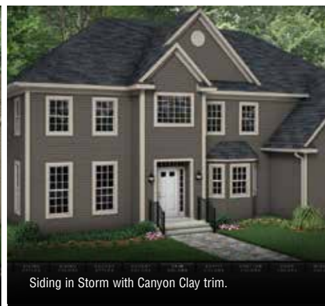
Siding in Storm with Canyon Clay trim.