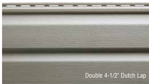
Double 4-1/2" Dutch Lap