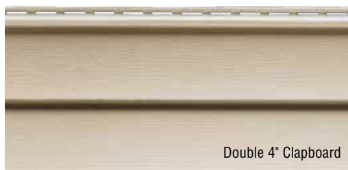
Double 4" Clapboard