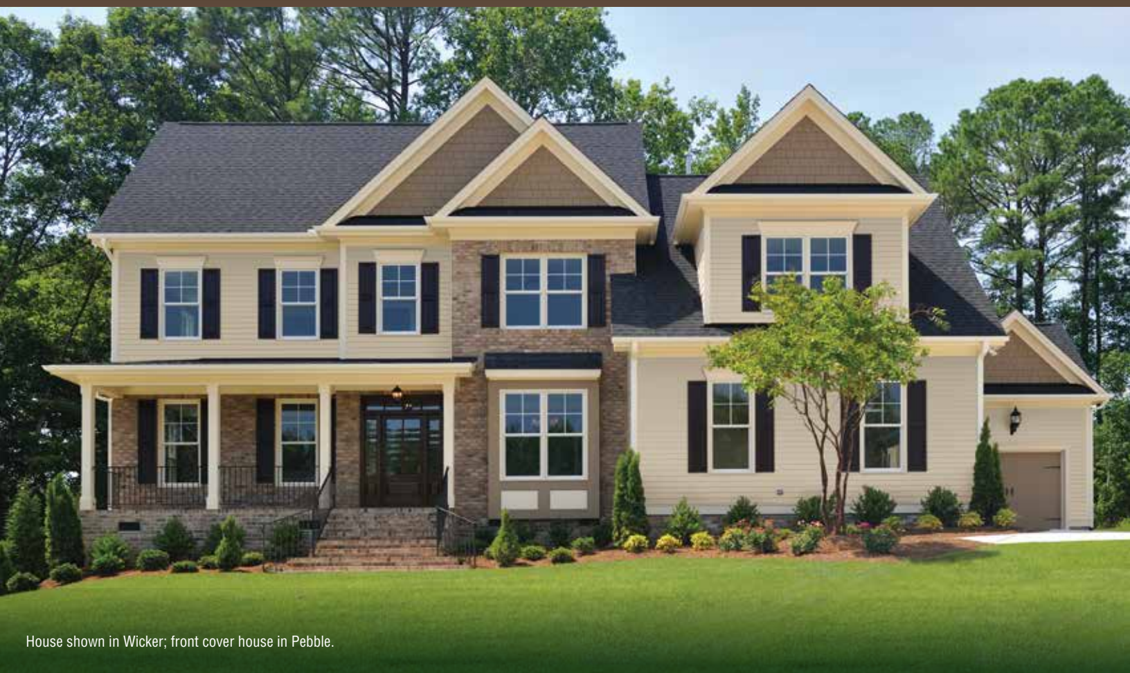
House shown in Wicker; front cover house in Pebble.

From classic to modern, Aurora II combines enduring style with everyday affordability. The low-gloss finish, natural cedargrain texture and rich palette of colors will beautifully showcase the architectural details of your home.