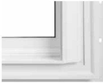
NC | 3/4" Brickmould