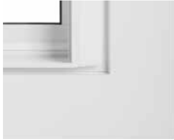
RM | 3-1/2" Casing, 4-Sided (Siding Cutback)