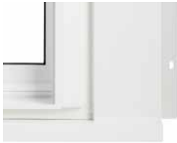
NC | 3-1/2" Casing with Bullnose Sill

RM – Replacement Market NC – New Construction/Home Addition Market