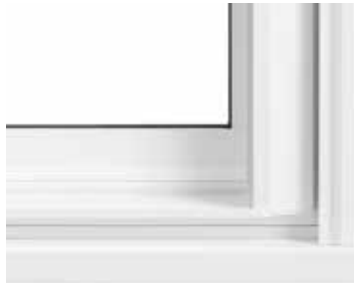
RM | Flushmount Brickmould with Bullnose Sill (Masonry)