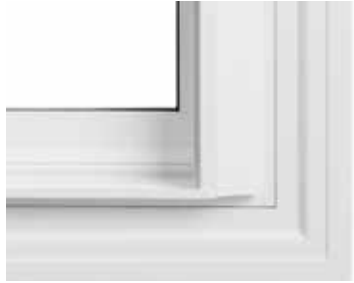
RM | 1-1/2" Brickmould (Siding Removal)

Customize the exterior window trim to complement any architectural style with our four distinct profile designs and six installation applications.