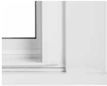
RM | 3-1/2" Casing with Bullnose Sill (Siding Removal)