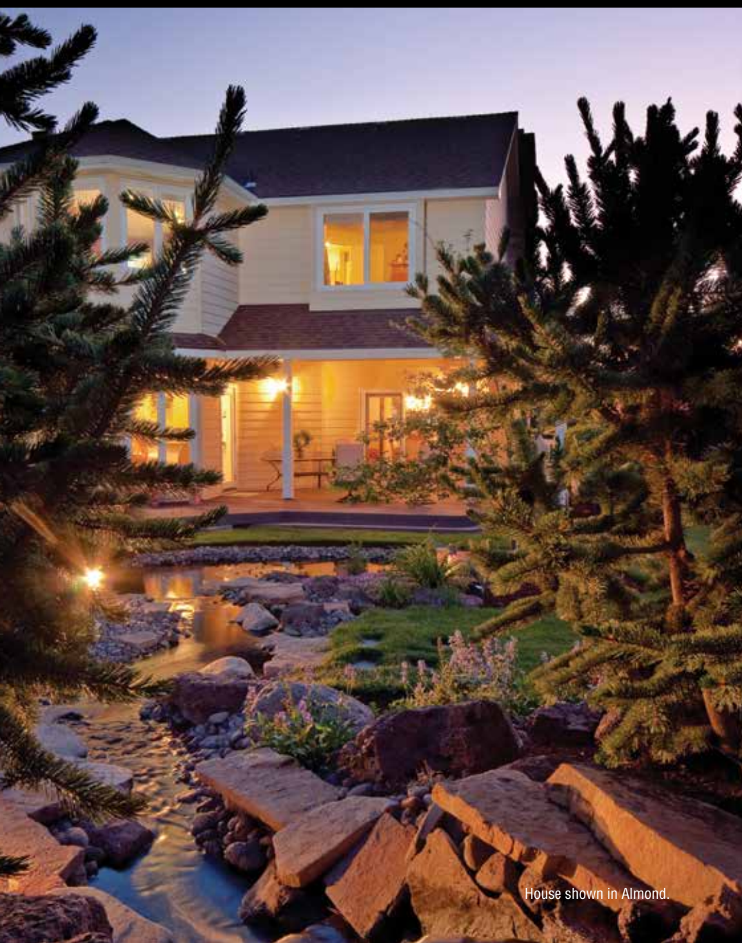
House shown in Almond.

A fusion of beauty and strength, Sequoia Select EnFusion blends an ultra-premium vinyl panel with energy-engineered insulation – creating a building envelope of superb quality and energy efficiency. It's luxurious, protective and lasting. It's a smart choice for you, a healthy choice for the environment.