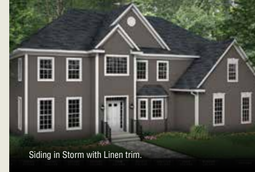
Siding in Storm with Linen trim.