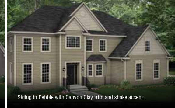
Siding in Pebble with Canyon Clay trim and shake accent.