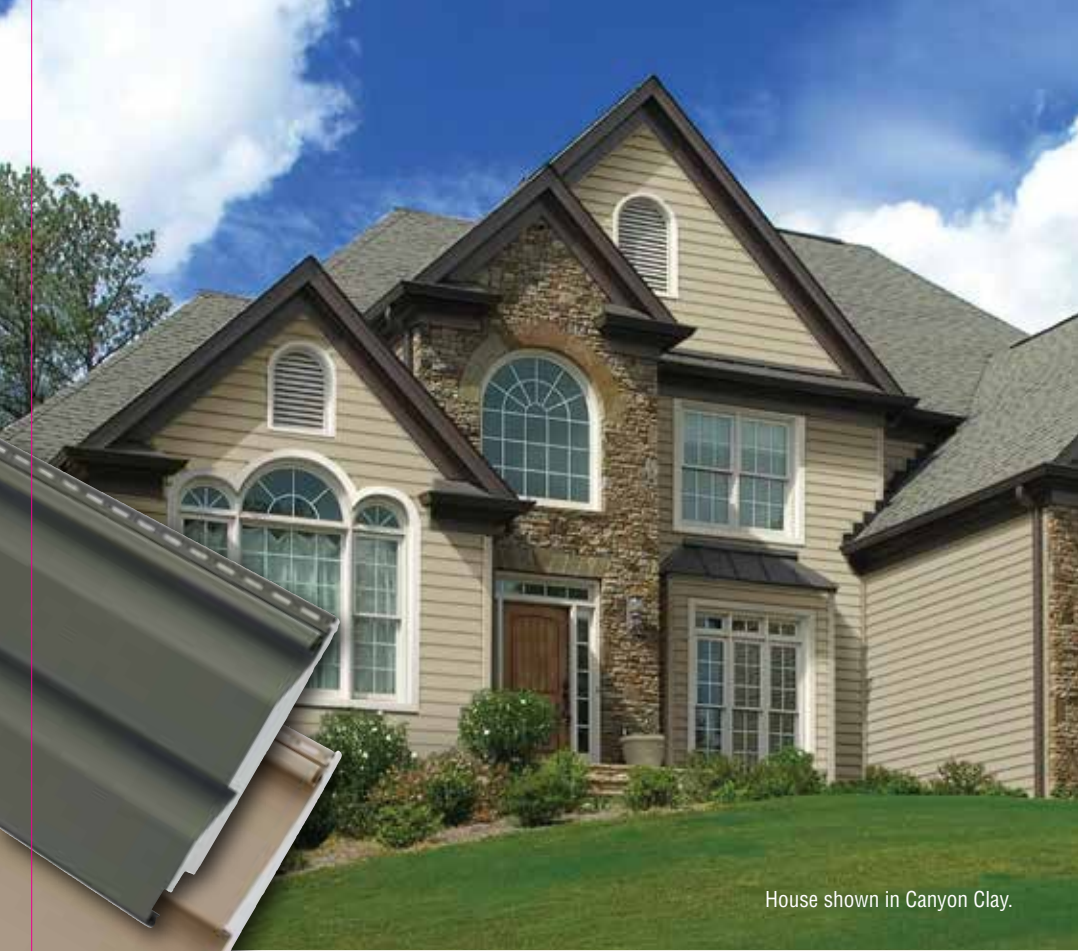
House shown in Canyon Clay.

THE BEST OF BOTH WORLDS: beautiful and energy-smart. Meticulously designed for impeccable quality, Sequoia Select EnFusion delivers exceptional beauty, protection and energy efficiency for your home. Featuring a luxurious, heavy-duty vinyl panel fortified with EPS (expanded polystyrene) rigid foam insulation, this innovative siding system is the pinnacle of modern practicality.