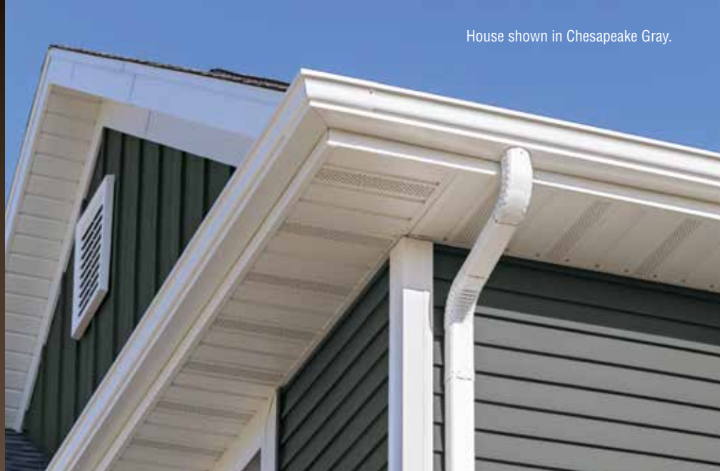
House shown in Chesapeake Gray.