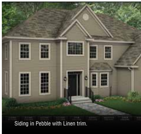
Siding in Pebble with Linen trim.