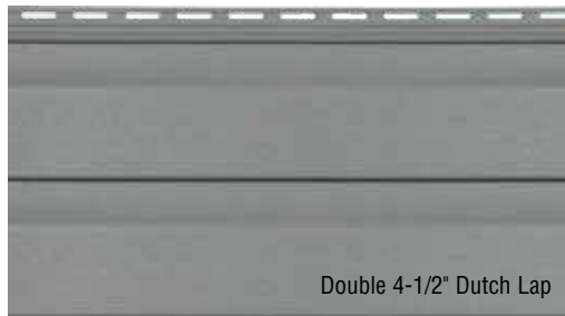
Double 4-1/2" Dutch Lap