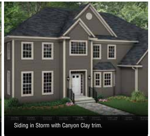
Siding in Storm with Canyon Clay trim.