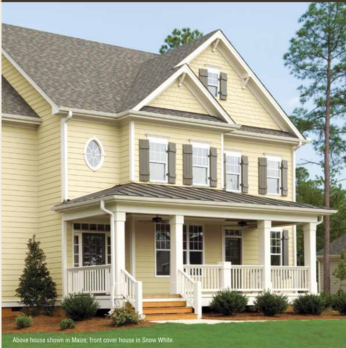
Above house shown in Maize; front cover house in Snow White.